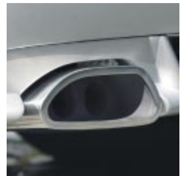
Harmony in sporting elegance: the rear of the ACS7 from AC Schnitzer. Large picture: rear skirt with AC Schnitzer sports rear silencer in Trap-Ment form (bottom right). Centre picture: the AC Schnitzer rear skirt for vehicles with standard exhaust Bottom left: the AC Schnitzer rear spoiler harmoniously extends the styling lines of the standard model.