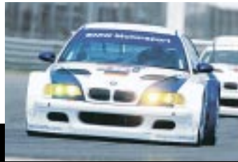
Winner of the American Le Mans Series: Jörg Müller 2001 in the BMW M3 GTR