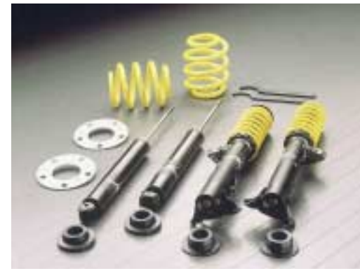
AC Schnitzer sports suspension including lowering, in sports comfort setting