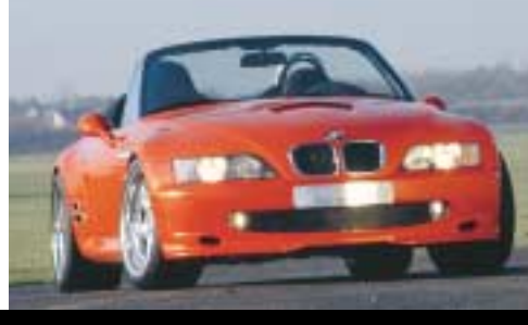
The first V8 roadster. AC Schnitzer was the first company to show a Z3 roadster with the V8 engine at the IAA 1997 show. This AC Schnitzer concept car, which received superb reviews in the international motoring press, served as a technology platform for our test department.