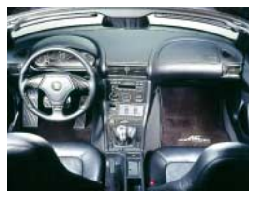
AC Schnitzer carbon fibre interior trim for vehicles with storage compartment or switch panel