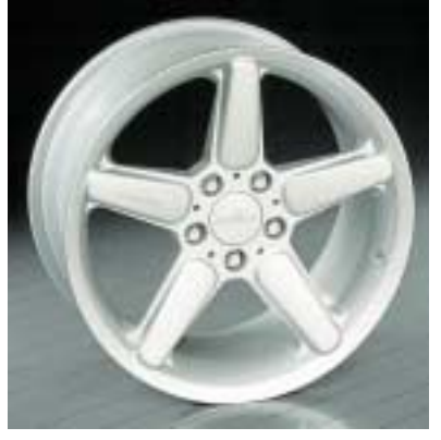
AC Schnitzer alloys Type II, silver, in sizes 7J x 15", 8.0J x 17" and 8.5J x 18"