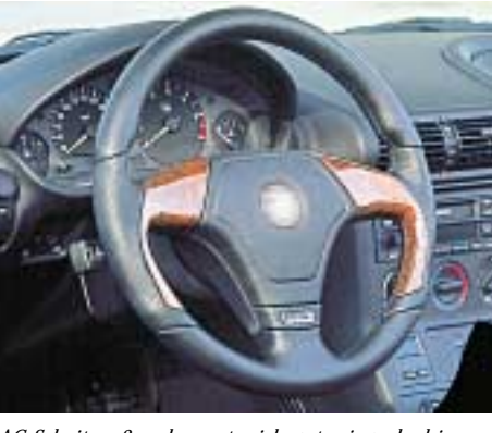
AC Schnitzer 3-spoke sports airbag steering wheel in leather with carbon fibre trim