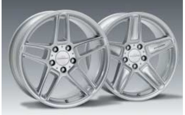
AC Schnitzer alloys Type III, silver, in sizes 8.5J x 17", 8.5J x 18", 9.5J x 18", 8.5J x 19" and 9.5J x 19", optional design elements can be painted individually. AC Schnitzer racing alloys Type III, multipiece silver, in sizes 8.5J x 18", 9.5J x 18", 8.5J x 19", 9.0J x 19" and 9.5J x 19", optional design elements can be painted individually