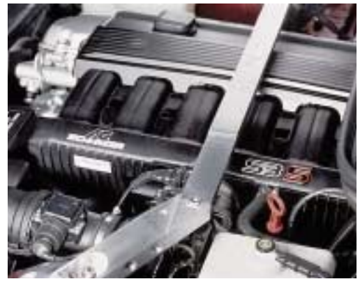
AC Schnitzer intake manifold kit Z3 S for BMW Z3 2.8 with M52 engine, power increase 18kW (25HP), strut brace for Z3 in preparation