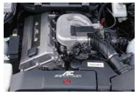
The AC Schnitzer Z3 2.1 makes even the 1.8 and 1.9 litre basic engines into very agile sports cars with a clear improvement in performance.