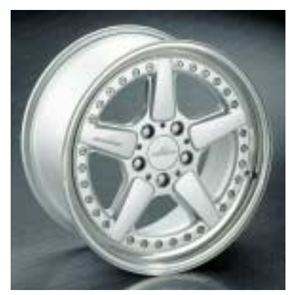
AC Schnitzer racing alloys Type II, silver with polished outer rim, in sizes 8.01 x 17", 9.01 x 17", 8.51 x 18", 9.01 x 18" or 9.51 x 18"