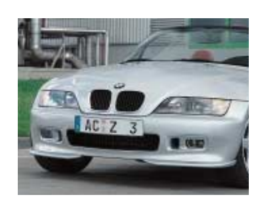
AC Schnitzer front flipper, 2-piece