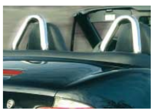
AC Schnitzer rollover bar of hand-polished V2A special steel for all BMW Z3 roadster with factory-fitted rollover bar