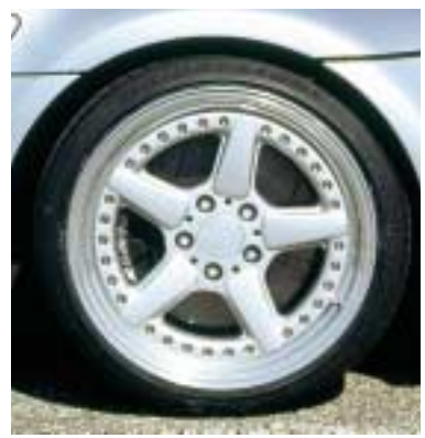
Already classic: AC Schnitzer alloy wheel variants Type II (above) and Type III (top) with variable spoke design.

One accessory essential for all AC Schnitzer Z3 is a set of AC Schnitzer Type II or Type III wheels. AC Schnitzer wheels stand out not just because of their high functiona-