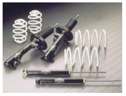
AC\ Schnitzer\ sports\ suspension\ including\ lowering,\ in\ sports\ comfort\ setting