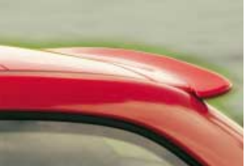
The AC Schnitzer rear roof spoiler for Z3 coupé