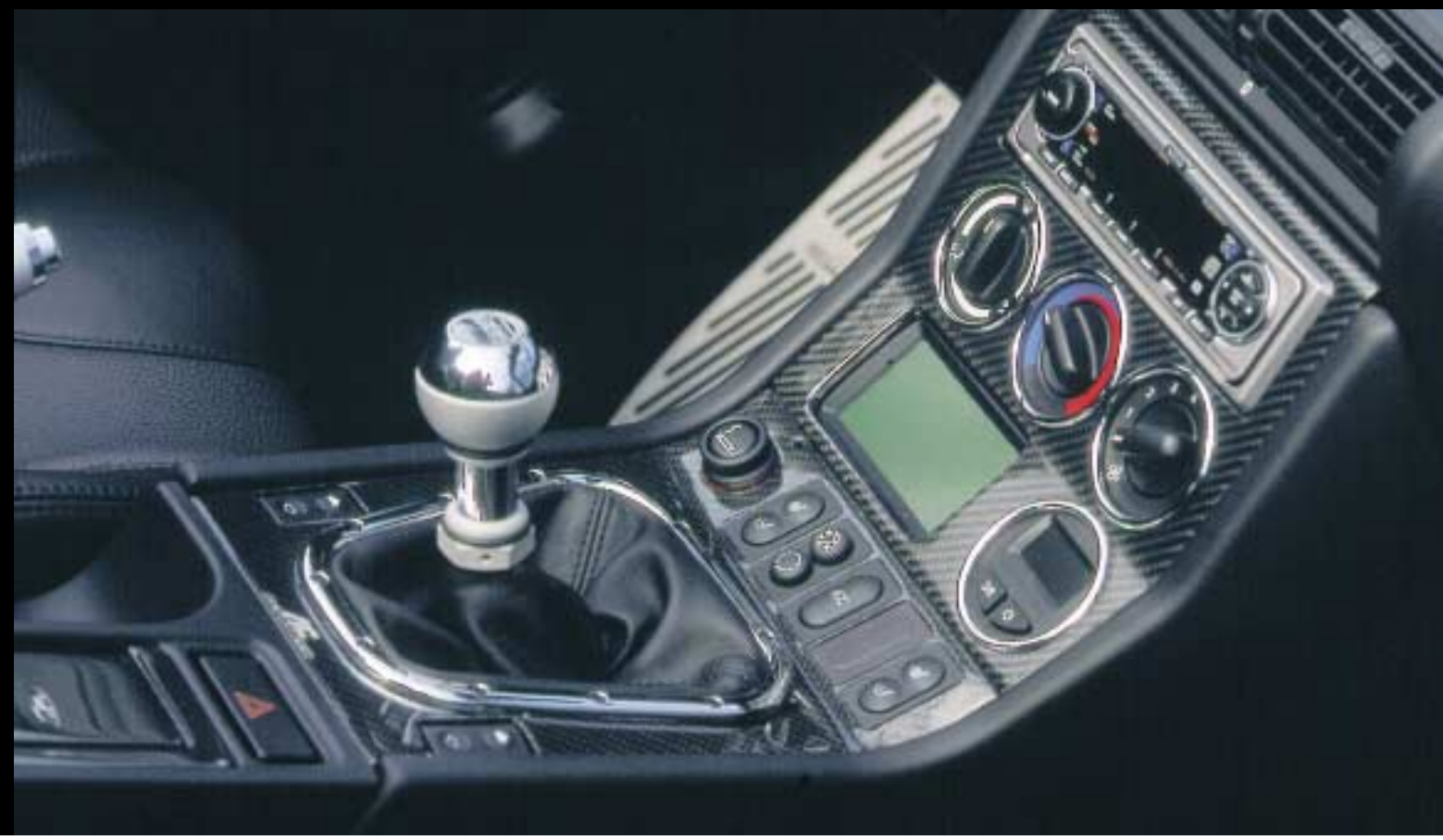
User-friendly technology centre: the AC Schnitzer carbon fibre centre console in the Z3 with AC Schnitzer audio concept incl. VDO Dayton navigation system MS 3000. Individual options on request