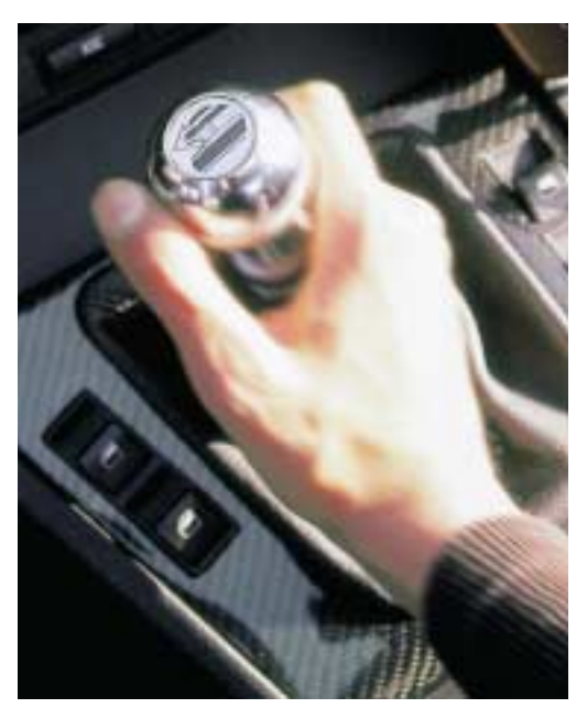
AC Schnitzer "Short Shift" sports gear change - shorter selector travel as fitted to Touring Cars