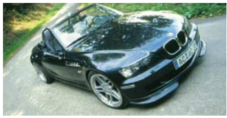
The AC Schnitzer front skirt with integral fog lights and enlarged air inlets to guarantee optimum aerodynamic performance

AC Schnitzer individual accessories: increased individuality and functionality.