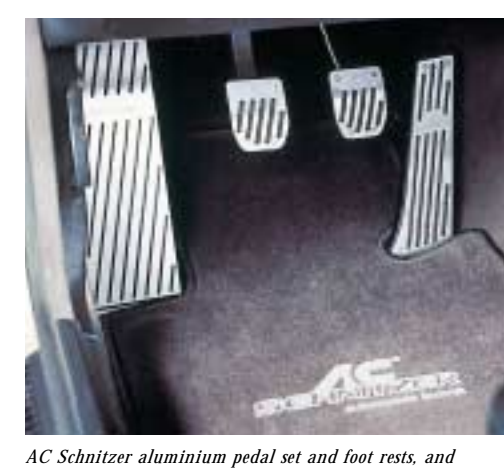
AC Schnitzer aluminium pedal set and foot rests, and AC Schnitzer velvet floormats