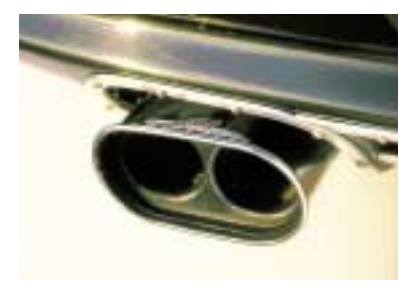
A highlight for eyes and ears: the rear of the AC Schnitzer M-roadster with twin sports exhaust.