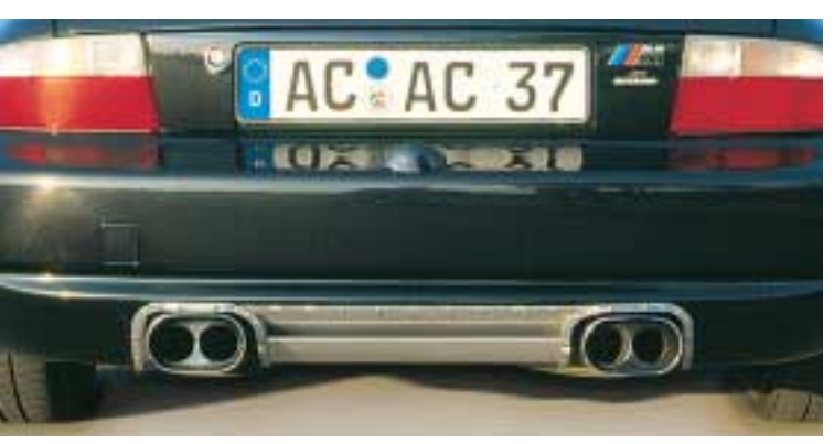
Listen to the music: AC Schnitzer Vmax module (removal of standard speed restrictor) including sports silencer made of V2A special steel for M roadster and M coupé. AC Schnitzer rear diffusor for M roadster and M coupé optional