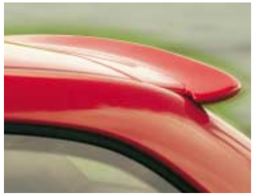
Aerodynamic in a discrete way - the AC Schnitzer rear roof spoiler for the Z3 coupé and the M coupé.