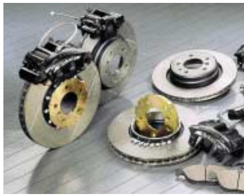
AC Schnitzer high performance brake kit with 2-piston floating caliper on the front and internally vented brake discs.