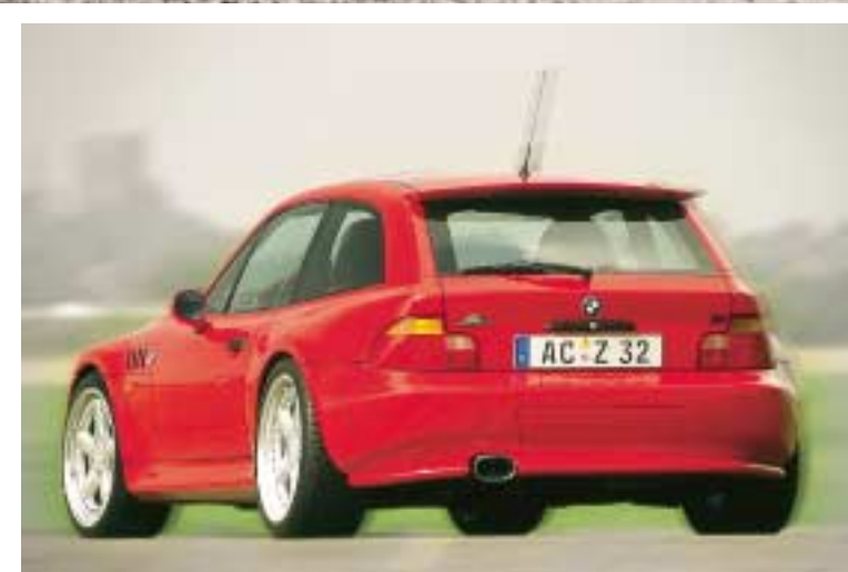
The AC Schnitzer aerodynamic components give the Z3 coupé the ultimate sports bodystyling. The 3.2 litre engine conversion provides the corresponding performance.

AC Schnitzer aerodynamic conversions have now become synonymous with the successful symbiosis of form and function. AC Schnitzer bodystyling accessories have a high level of functionality: for example the AC Schnitzer front spoilers increase downforce on the front axle and thus improve driving stability considerably. All parts are also made of high quality PU-Rim and have a fitting accuracy usually only achieved in mass production. AC Schnitzer bodystyling components are also designed for maximum aesthetic appeal and individuality.