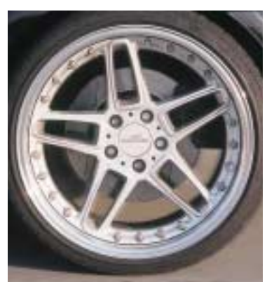
The third generation of this classic design: the AC Schnitzer alloy wheel Type III, shown here with open spokes.