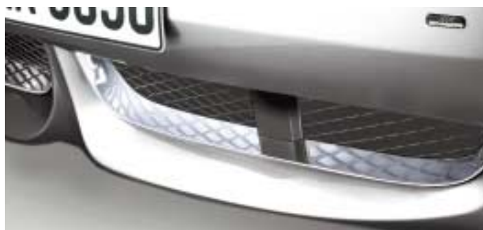
The AC Schnitzer performance upgrade for the X3 3.0d consists of the Control Unit Program and the optional AC Schnitzer sports rear silencer made of V2A with chromed tailpipe in Racing design. The AC Schnitzer rear skirt first neatly around the exhaust system. The optional AC Schnitzer Chromeline Set provides highlights in the front skirt.