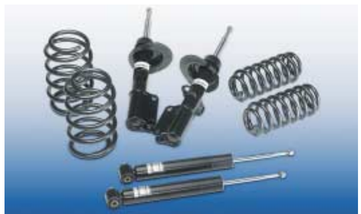
Authentic motorsport feeling in the AC Schnitzer ACS3 with carbon interior trim in silver, sports airbag steering wheel with carbon applications and numerous accessories in brushed aluminium (top picture). With the AC Schnitzer sports suspension (bottom), even the driving dynamics of the X3 move into the sporting range.