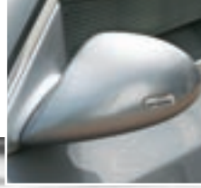
AC Schnitzer sports mirror with all standard functions.