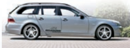
Tailor-made: rear roof spoiler and rear skirt pick up the lines of the standard vehicle and set a sporting note.