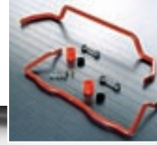
AC Schnitzer special anti-roll bar set with 2 adjustment positions.