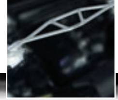
AC Schnitzer strut brace increases the torsional rigidity of the vehicle front.