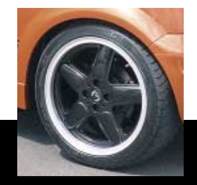
AC Schnitzer alloy rims Type I: The classic star wheel in black or painted body colour, combined with a polished ring. Just right.

The sense of time and space you experience in a MINI Cabrio by AC Schnitzer has its own unique, dynamic note. The atmosphere of exclusive materials, the style of sophisticated design and the superior technology from motorsport lift that cabrio feeling into a new, higher sphere. Always open, always sporting.