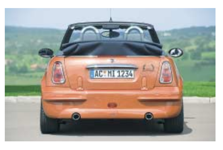
Striking front, dynamic rear: With aerodynamic components of PU-rim and twin pipe exhaust system of V2A with chromed tailpipes.