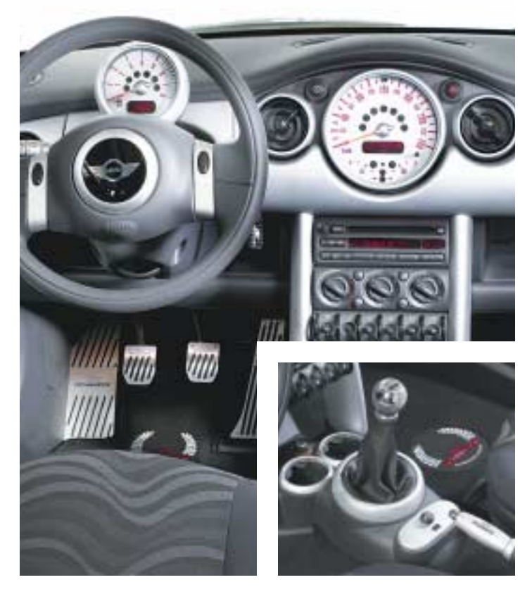
Authentic motorsport feeling: With lightweight materials and sporting design, in the MINI by AC Schnitzer there's a real motorsport atmosphere. Let the sunshine in. With the 710 x 810 mm AC Schnitzer folding sunroof, there's a sunny outlook in just a few turns of the hand.

The authentic motorsport feeling is supplied by the AC Schnitzer interior components. The aluminium pedal set with matching foot rest cover, aluminium gear knob and aluminium handbrake handle, and the two-colour foot mats with the AC Schnitzer "Technology & Design" logo complete the sporting image. In addition AC Schnitzer offers tailormade solutions in the fields of traffic telematics and Car-Infotainment.